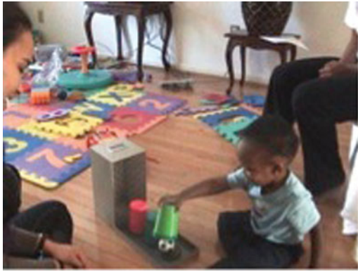
Figure 2. (Colour online) Eighteen-month-old completing a trial on the Hide the Pots WM task.

MCDI Words and Sentences Short Form is appropriate for infants 16- to 30-months of age and contains a 100-word checklist. Of the 100 words, 52% of the items were nouns, 18% were verbs, 15% were adjectives and adverbs, and 15% were pronouns, prepositions, and other parts of speech (Fenson, Pethick, Renda, Cox, Dale & Reznick, 2000). A short-form of the MCDI was not available for infants growing up in Spain (the available Spanish form is used for Spanish-speaking countries outside of Spain), therefore modifications were made in order to collect the most accurate vocabulary totals. For the bilingual infants in Washington DC, the caregiver was asked to fill out the same form for both languages, marking the words the infant could produce and in which language (English, Spanish, or both). For the infants in Barcelona, a native Spanish/Catalan bilingual who was also fluent in English translated the MCDI. Again, parents were asked to mark the words the infant could produce in which language (Spanish, Catalan, or both).