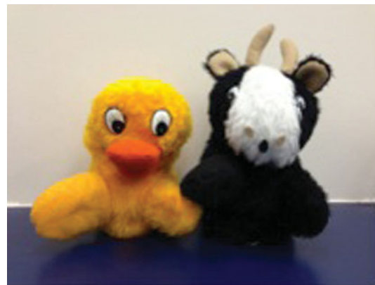
Figure 1. (Colour online) Duck and cow puppets used in DI task.

For the generalization task, two hand puppets (a black-and-white cow and a yellow duck with an orange bill) 30 cm in height and made out of soft acrylic fur were used. A removable felt mitten (8 cm x 9 cm) was placed